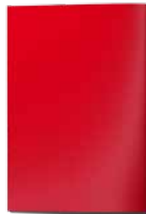
Insertion 1/1 page inside front/back cover, outside back cover 210 x 297 mm 3,500.00 EUR