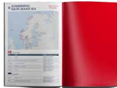
Insertion 1/1 page, 210 x 297 mm 2,500.00 EUR

Bank: Hamburger Sparkasse IBAN:DE88 2005 0550 1048 2156 59 BIC:HASPADEHHXXX