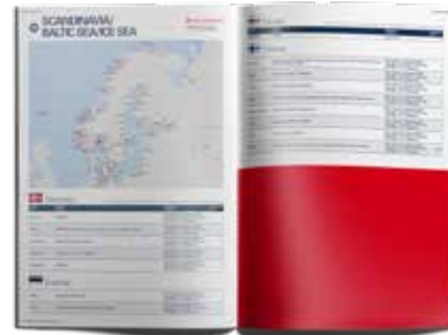
Insertion 1/2 page, 210 x 145 mm 1,500.00 EUR