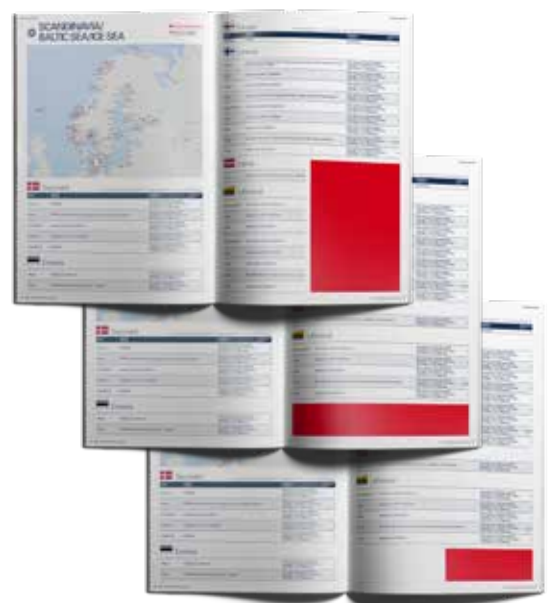
1/4 Insertion, 90 x 130 mm, 800.00 EUR 1/1 Banner, 185 x 31 mm 500.00 EUR 1/2 Banner, 90 x 31 mm 250.00 EUR