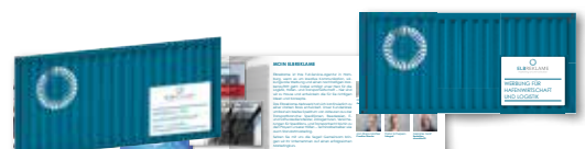
Inserts: Inserted loose for example 210 x 105 mm, 6-Page (specifications on request)