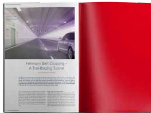
Insertion 1/1 page 210 x 297 mm 3,000.00 EUR

Bank: Hamburger Sparkasse IBAN:DE88 2005 0550 1048 2156 59 BIC:HASPADEHHXXX