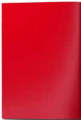
Insertion 1/1 page inside front/back cover, outside back cover 210 x 297 mm 4,500 EUR