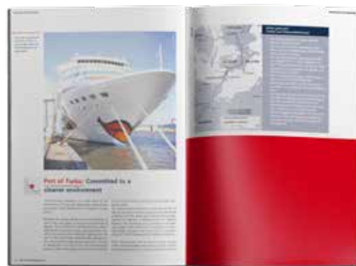
Insertion 1/2 page 210 x 145 mm 1,700.00 EUR