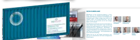
Inserts: Inserted loose for example 210 x 105 mm, 6-Pager (specifications on request)