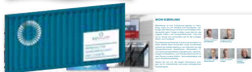
Inserts: Inserted loose for example 210 x 105 mm, 6-Pager (specifications on request)