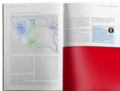
Insertion 1/2 page 210 x 145 mm 1,700.00 euros