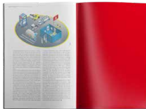
Insertion 1/1 page 210 x 297 mm 3,000.00 euros